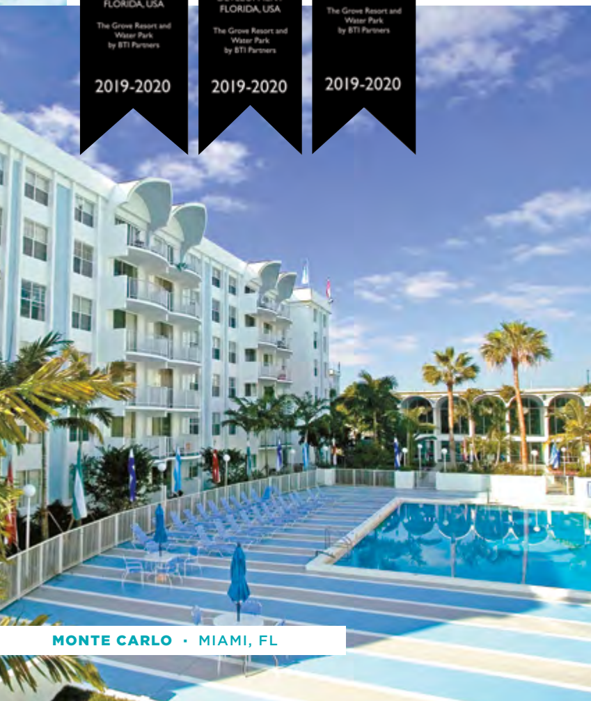
MONTE CARLO • MIAMI, FL