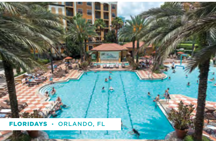
FLORIDAYS • ORLANDO, FL

has a global reputation and a proven track record of consistently producing sound financial results for their hotels and owners year after year. Their team of corporate executives are hospitality industry veterans that provide hands-on support and attention to the full portfolio of hotels and resorts on a daily basis.