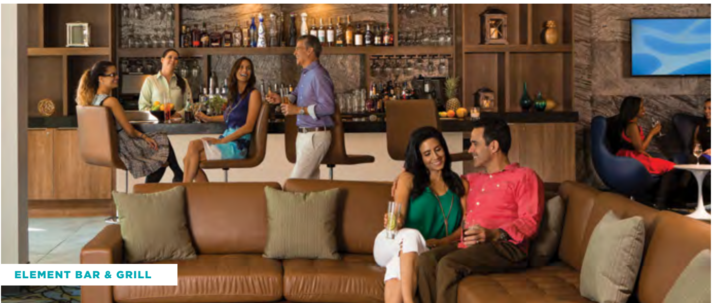
ELEMENT BAR & GRILL