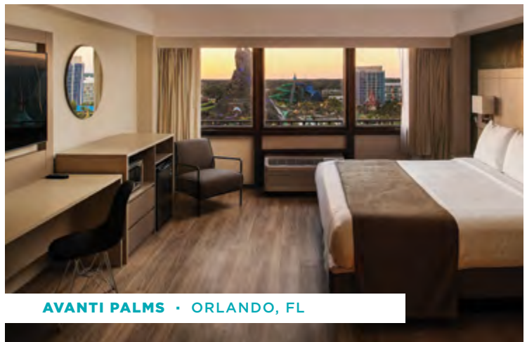
AVANTI PALMS • ORLANDO, FL