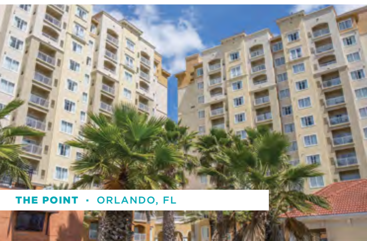
THE POINT • ORLANDO, FL