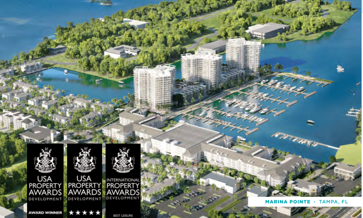
MARINA POINTE • TAMPA, FL